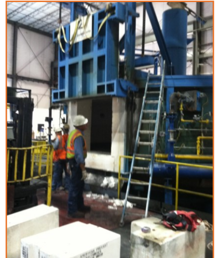
Charge door on rotary hearth furnace