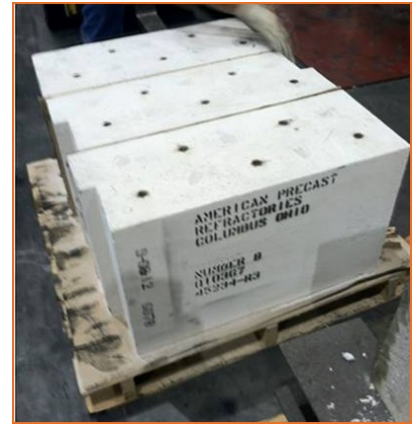
ARMORMAX 70 SR lintel blocks

Allied Mineral Products, Inc. supplies an entire line of monolithic refractories for the metals industry. For more information or a complete evaluation of your refractory requirements, please contact your local Allied representative.